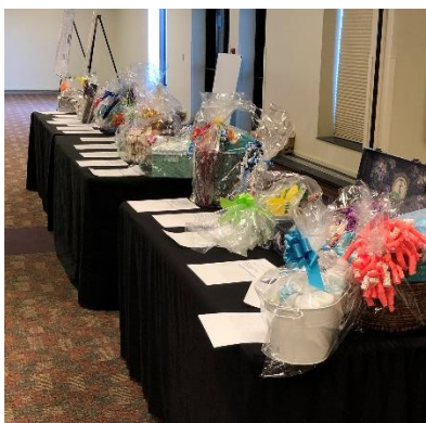
2019 Silent Auction

A silent auction fundraiser was held on March 26, 2019. This fundraiser helps to support Society projects, such as our programs and awards! The silent auction raised $407 this year! Thank you to members who donated items to the silent auction for this fundraiser! And thank you to those who participated in the auction!