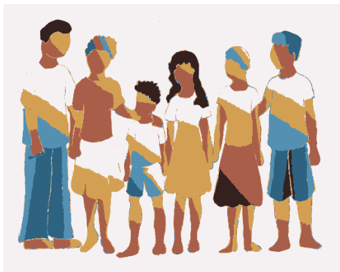
Family open clip art